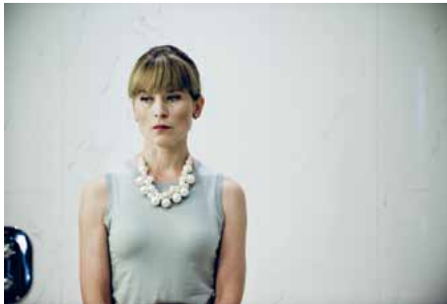
↑ In the Bedroom Tomasz Wasilewski 2012

They say we Poles are intense. We get heated up, gesticulate, ramble on in overly long sentences or hold back sullenly. We drown our sorrows, so says the stereotype. This is the face we mould for ourselves; this is the face moulded for us. But it's not the only one. The Slav god, Svetovid, had four. What would Polish faces formed by film images made in Poland look like today?