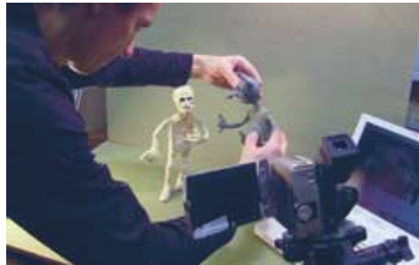
↑ Kid's Animation Workshop

9, 10 AND 16, 17 MARCH 10.00AM — 4.00PM EACH DAY RIVERSIDESTUDIOS